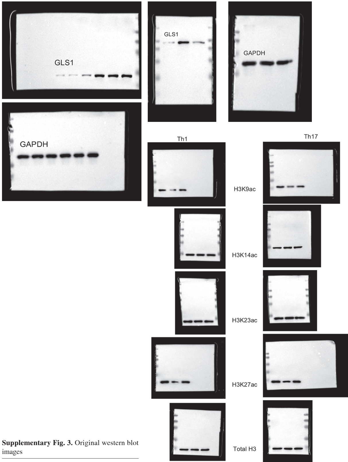
Supplementary Fig. 3. Original western blot images